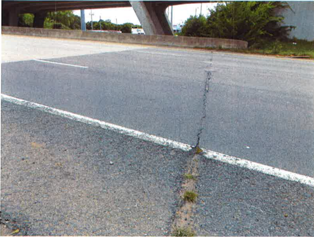
Pic #40 Part of the Bridge and Approach #1 is covered w/ Asphalt