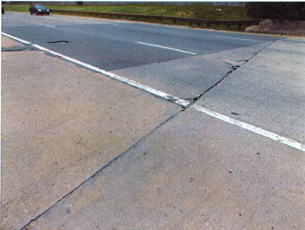
Pic #41 Most Part of Approach #2 Covered w/ Asphalt; Bridge No. 19-I440-0.36L